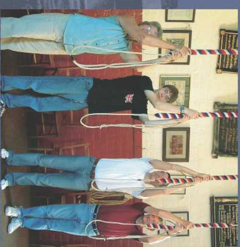
The ultimate team activity