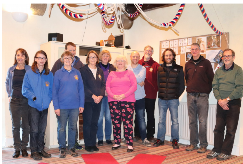
Some of the ringers, at the end of a busy day