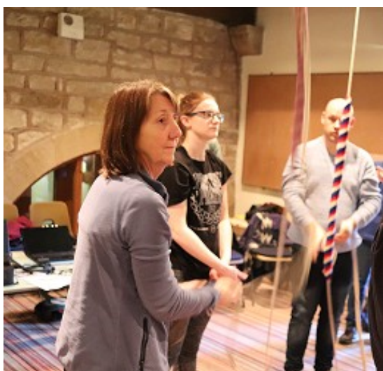
Putting it all into practice